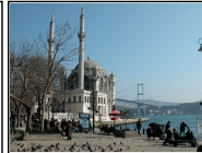
Istanbul on Travel in 10