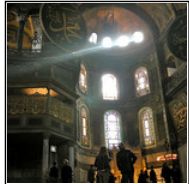
Hagia Sophia – Istanbul, Turkey – Photo