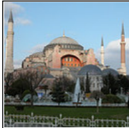
Turkey, Istanbul – Episode 83